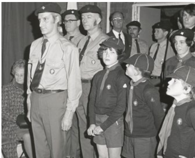
Lord Baden-Powell’s grandson’s visit 1975