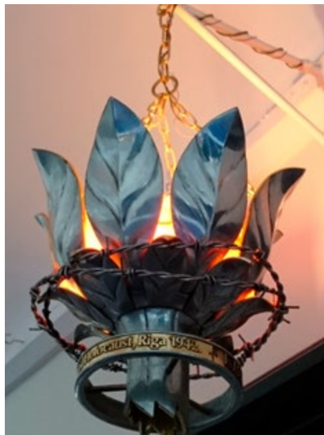
Ner Tamid (eternal light)

This year, we celebrated our 50th anniversary. The weekend of Friday 21 April and Saturday 22 April 2017 fell almost precisely 50 years after the Public Meeting held, in April 1967, at Surbiton Assembly Rooms to discuss the formation of a Progressive Jewish Community in Surrey which led to the formation of KLS.