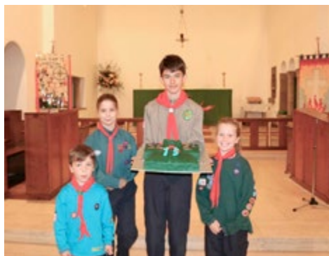
A scouting themed cake to celebrate

In September, Weston Green Scout Pack celebrated its 75th birthday. A great day was had by all. Read more in the article on page 21.