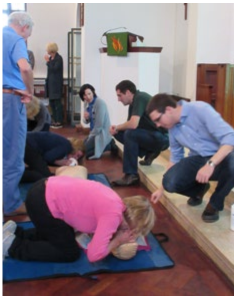
More than 50 residents attended First Aid training

Community First Aid Training Sessions run by the George Bairstow Charitable Trust were held in All Saints church in Weston Green in October. More than 50 residents came to the sessions which gave basic training on the practical and immediate steps you can take in the event of a cardiac arrest.