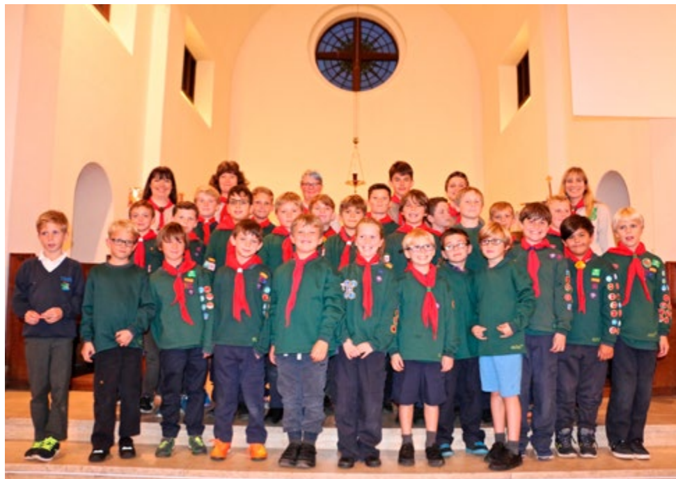
Celebrating 75 years of scouting