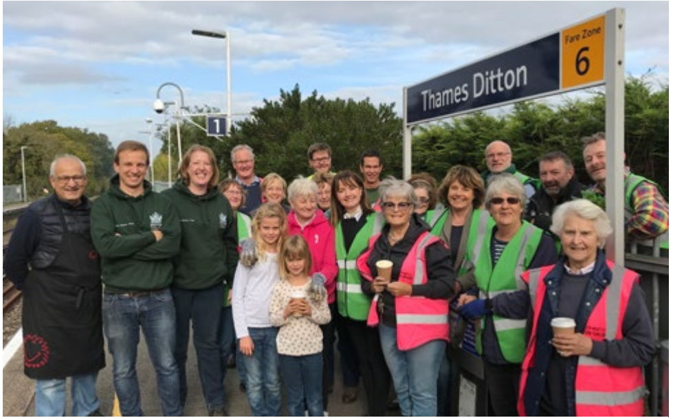
Thames Ditton in Bloom Team

and ponds and this is the 27 th year the RA has funded the bulbs. We have plenty of Spring flowers to look forward to.