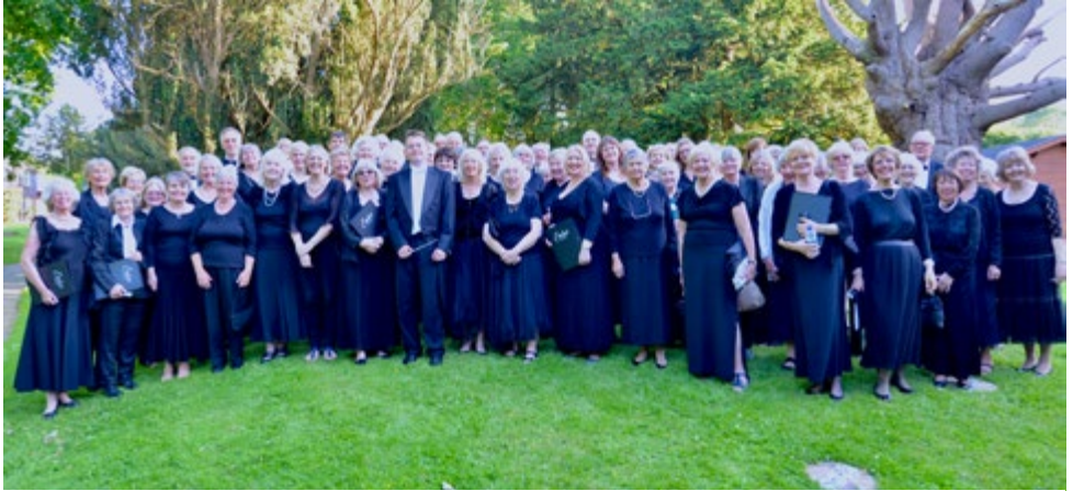
Ember Choral before their concert at Yehudi Menuhin Hall, Stoke D'Abernon