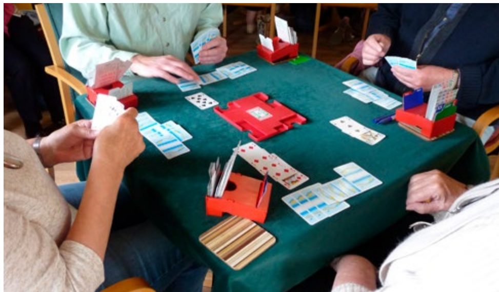
Some attendees enjoy a hand of bridge

the lovely wooden planters at Thames Ditton railway station. It has a growing membership and you can meet 'Men in Sheds' at the monthly Farmers' Market.